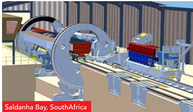
Saldanha Bay, SouthAfrica

Turnkey design and/or manufacture including all engineering disciplines; mechanical, electrical and civil.