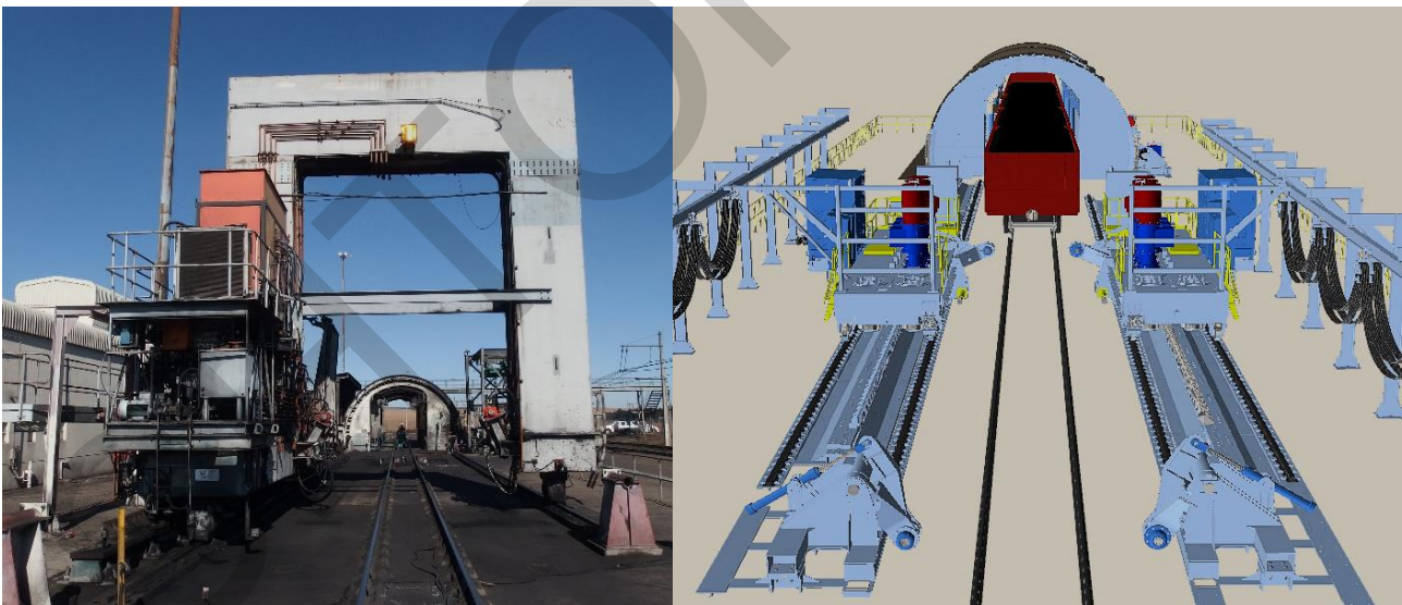
MAJUBA BRIDGE TYPE TRAIN POSITIONER REPLACED BY TWIN SYNCHRONISED POSITIONERS

At mid-point in the design engineering process, our client requested that physically differing wagons from the originally specified unit train type be handled by the system. Based on this request Ashton Bulk needed to revise the control system handling methodology and the manner in which the Positioners and Train Holding equipment physically engaged with the trains. These revisions were undertaken in accordance with strict time limits and the required handling rates and throughput of the system were maintained.